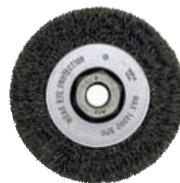
Wire Wheel Brush