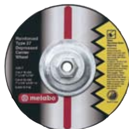
Pipe Line Wheel